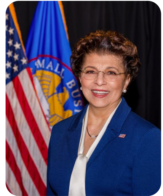
Administrator Jovita Carranza

Upon a request received from a state's or territory's Governor, SBA will issue under its own authority, as provide by the Coronavirus Preparedness and Response Supplement Appropriations Act that was recently signed by the President, an Economic Injury Disaster Loan declaration.